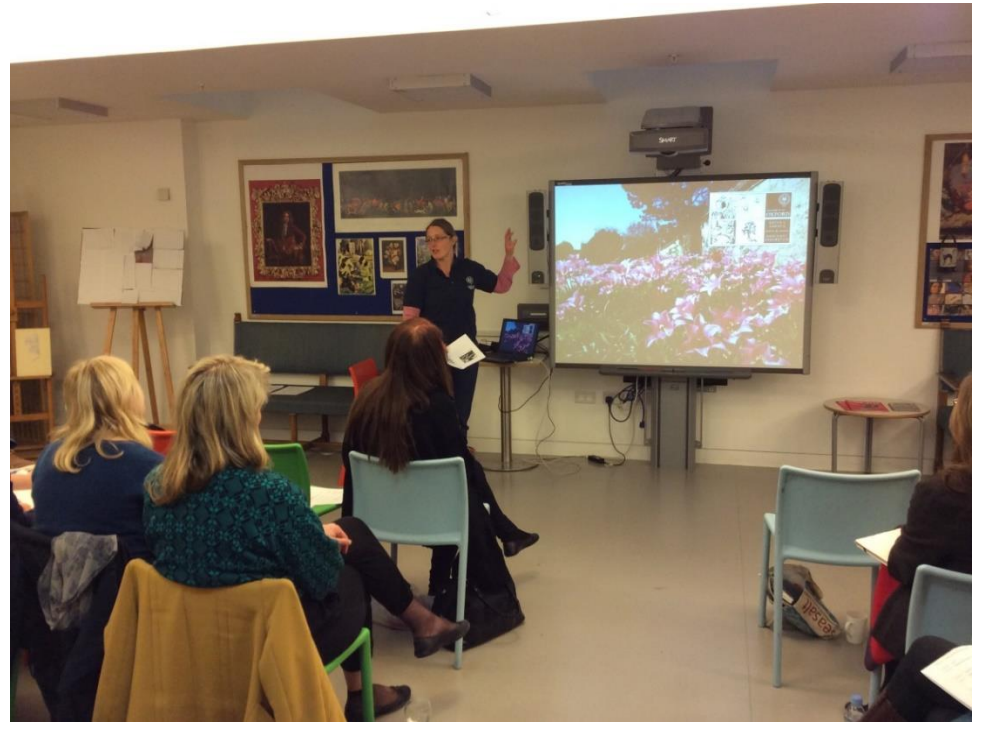
Presentation during training day

Park, The Oxfordshire Museum, REME Museum of Technology, Oxford Castle, Maidenhead Heritage Centre, Roald Dahl Museum, Reading Museum, Museum of Oxford, River and Rowing Museum, The Story Museum, Jane Austen House, and Geffrye Museum.