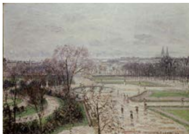
Camille Pissarro (1830 - 1903) The Tuileries Gardens, Rainy Weather; oil on canvas; 65 x 92 cm. Signed and dated: C. Pissarro. 1899. This is one of sixteen canvases painted from the windows of the apartment Pissarro rented at 204 rue de Rivoli, Paris, from January 1899. The view looks over the Tuileries towards the Seine, with the spires of the church of Sainte Clothilde on the right. On display in Gallery 65, Pissarro and the Impressionists.