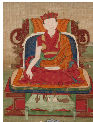
Room 32 India from 600: Tibetan Thangkas, mid 18th Century (EA1991.179)

Made from clay collected near the shrine at Kerbala that commemorates martyrdom of Husain.