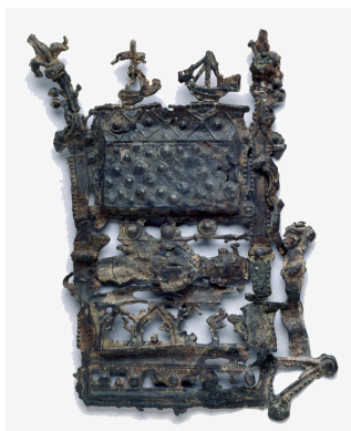
Gallery 41 England 400-1600: Pilgrim Badges and cast 1270-1400, London (AN1988.397)

Explore the museum to find other objects used for personal worship and reflection: