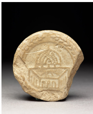
Room 28 Asian Crossroads: Clay Pilgrims Tokens, Iraq, Kerbala (EA2002.25-31)

Depicting the shrine and martyrdom of Saint Thomas Becket and thought to provide personal protection.