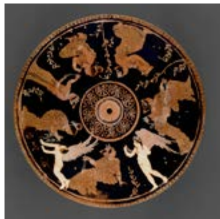
Athenian red-figure pyxis (lidded box) attributed to the Meidias Painter, 420-401BC. This jewellery box is embellished with added gold leaf and shows women trying on necklaces, with the help of the winged Erotes, gods of love and lust. AN1896. 1908 G.302