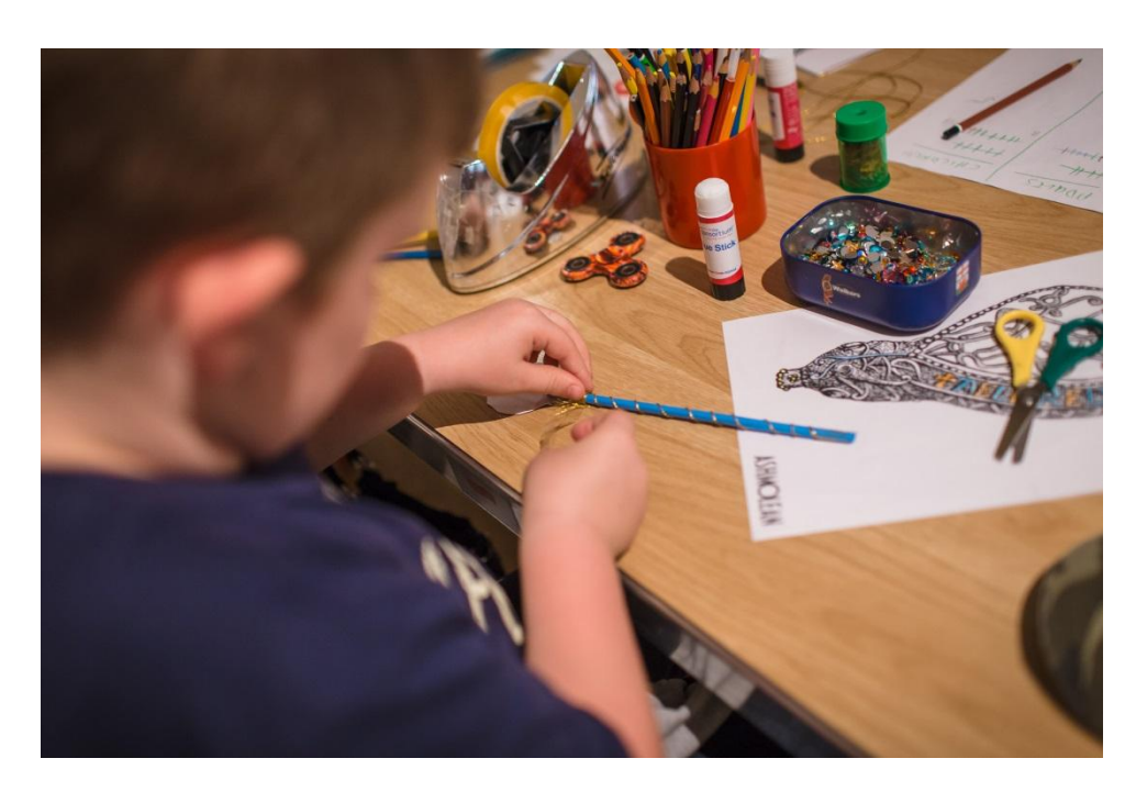
Hand crafting an aestel at the Big Weekend