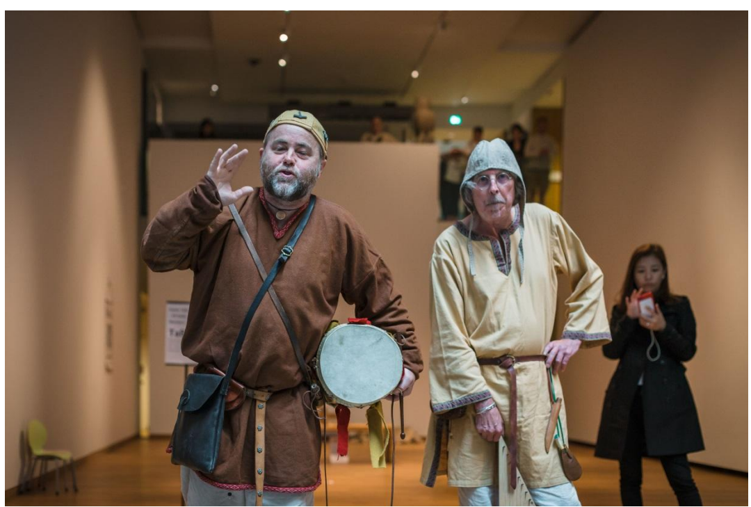
Performances by Ta-Bard at The Big Weekend