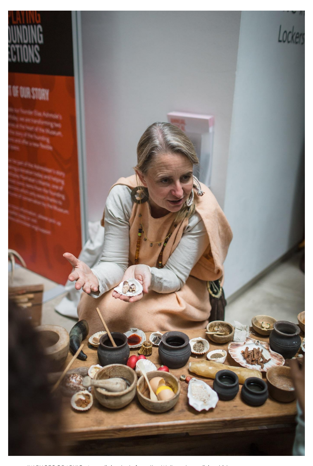
A medicine lady from the Wulheadonas living-history group