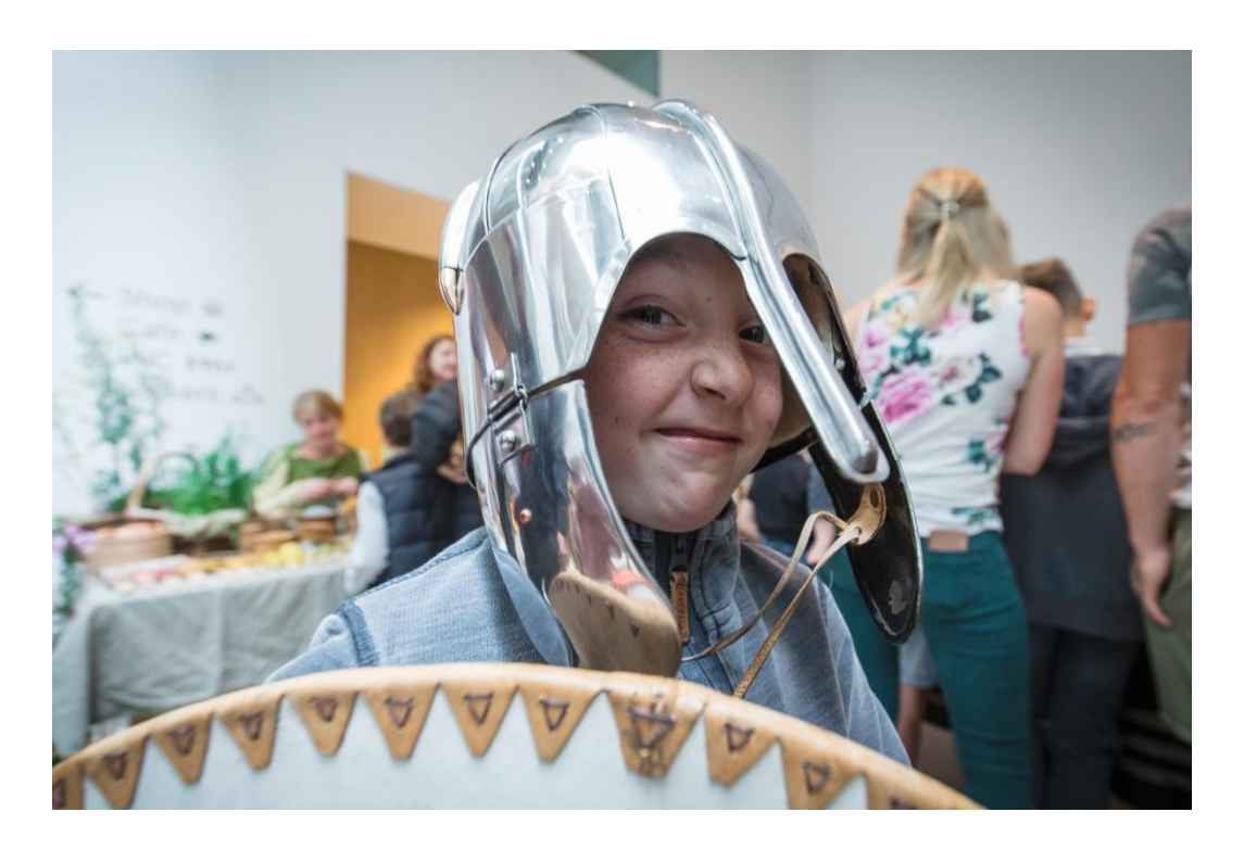
Trying on Anglo Saxon Armour at the Big Weekend event

In return for their comments, museum visitors were offered a chance to win two free tickets to the Raphael Exhibition. The prize winner thanked the museum for her prize and commented that 'It was a great day, one we'll all remember'.