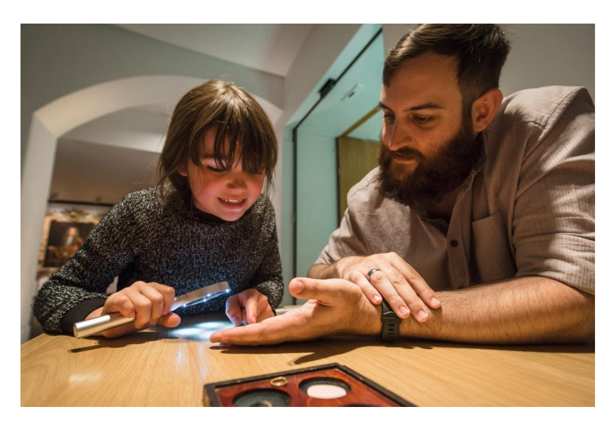
IW PHOTOGRAPHIC: Coin handling with museum volunteers at The Big Weekend event

'Very well organised regarding the steps to follow and how the space was arranged for that. But, above all, in my view it was a very adaptable activity for both, older smaller children - all of them managed to make really beautiful coins no matter the age- I was really impressed!! I am aware it is not easy to arrange a craft which works out for different ages' (Volunteer feedback).